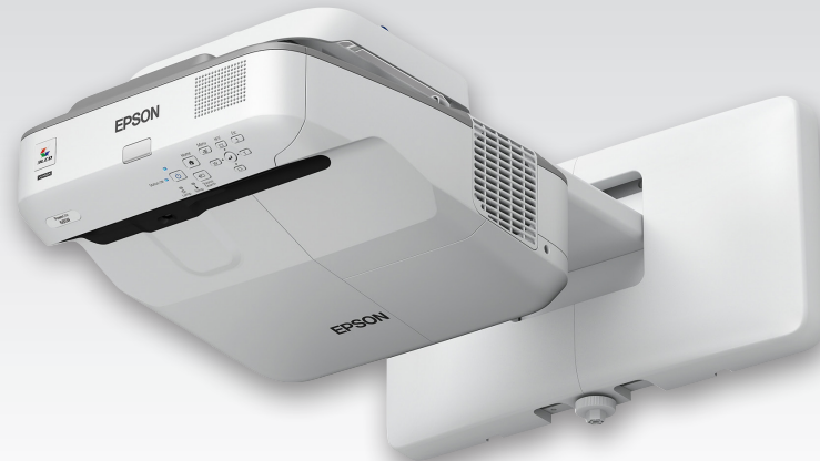
Shown with optional wall mount (sold separately)